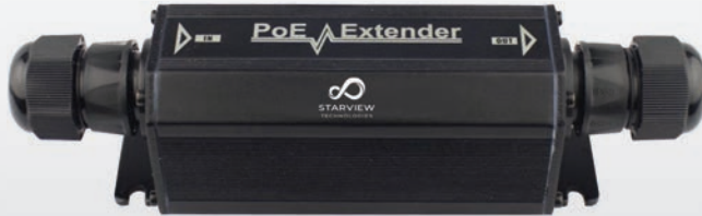
Outdoor use weather-proof Single port PoE extender